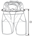
PANT SHELL SIZING CHART (INCHES)